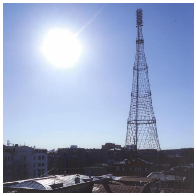
Illustrations title: Umlauftank II Berlin, back: Shukhov Tower Moscow

ICOMOS Germany Brüderstr. 13 10178 Berlin ICOMOS@ICOMOS.de